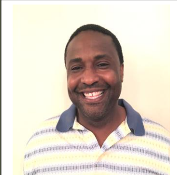
Graduation photo-June 2022