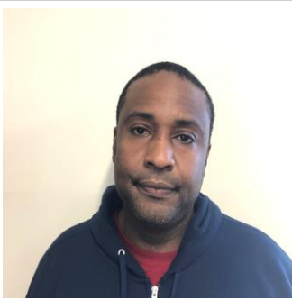
Entry photo-November 2021