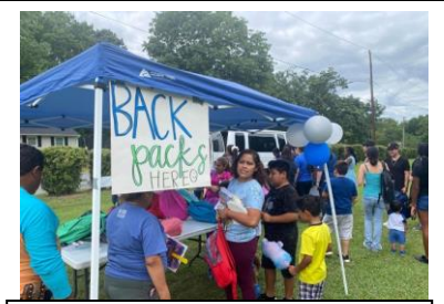
Thanks to all who donated for this event. There were twelve salvations. Many souls were blessed by the love of God.